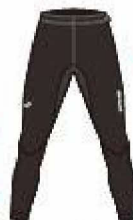
C/# 009 BLACK