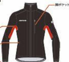
C/# 009 BLACK