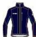
C/# 699 NAVY